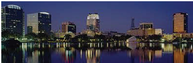
The next APA convention will be in Orlando, Florida

Save the dates 8/2/11–8/5/11! We hope that you can make it this year. Stay tuned for information on our planned programming and events.